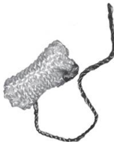
Fig. 1: Dental Cell tampon.

T-test, the Exact Fisher and Chi-Square tests (Values of p \leq 0.05 were considered significant).